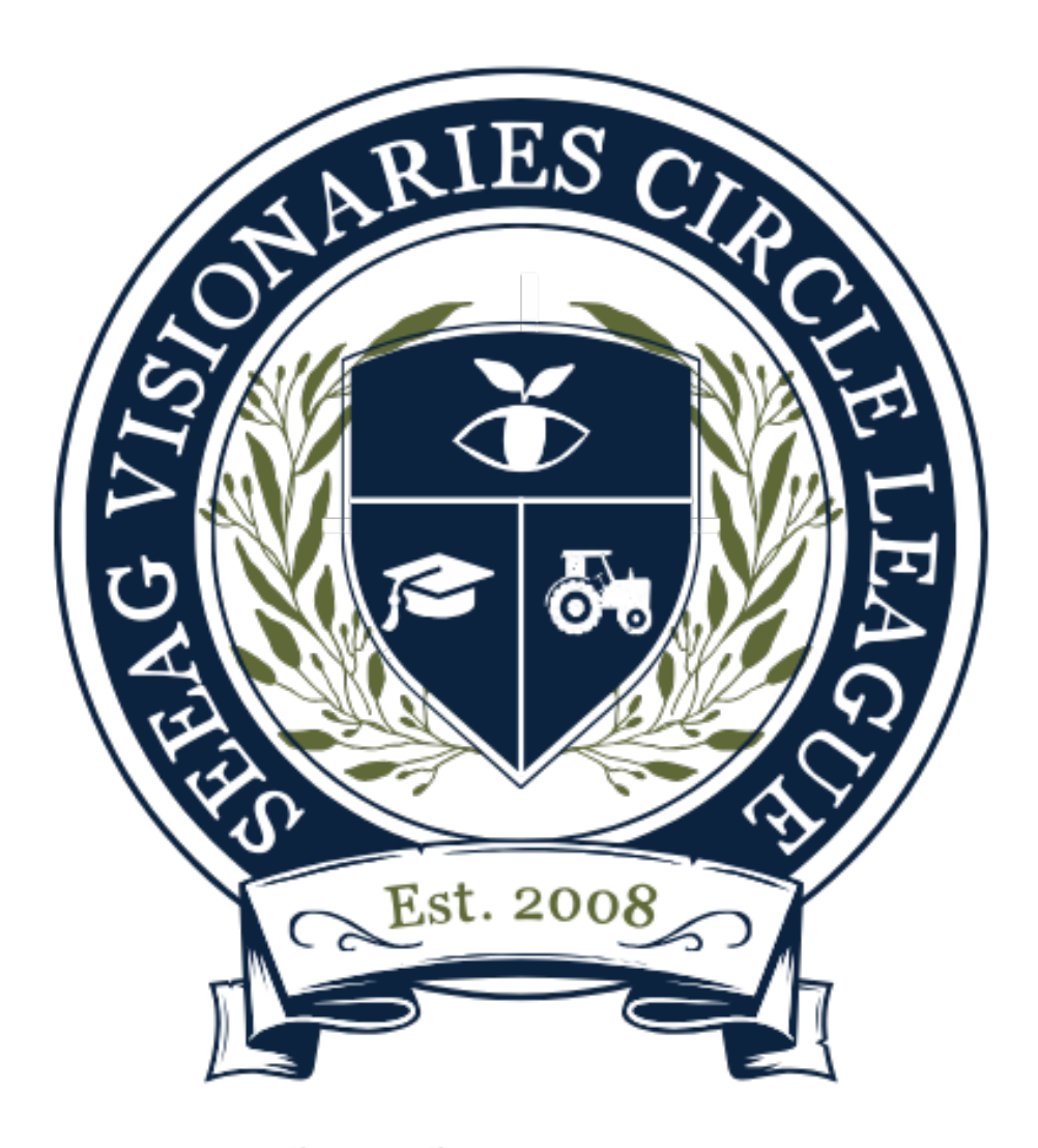
Lead. Educate. Serve.